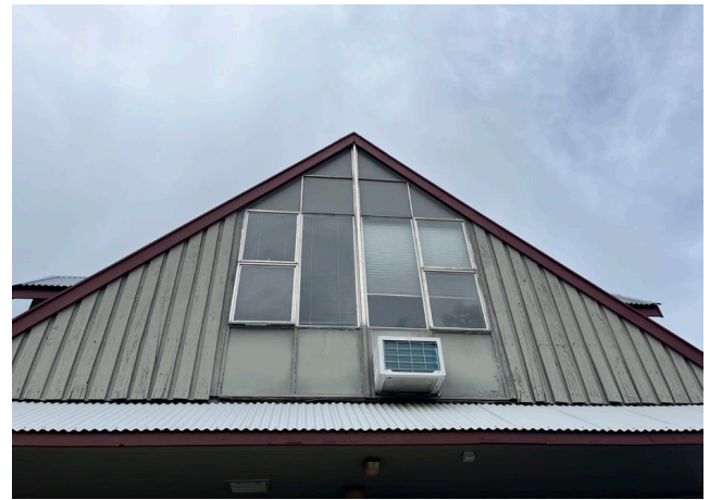
Figure 4 Window - northern end. Note the deterioration of both window and cladding fabric. Source: Kosciuszko Thredbo Pty Ltd, 18.05.23