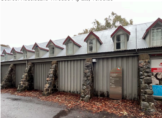
Figure 3 External wall of retail store. Note cladding deterioration along base of the wall. Source: Kosciuszko Thredbo Pty Ltd, 18.05.23