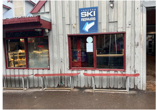
Figure 2 Facing Avalanche cafe. Note cladding deterioration.