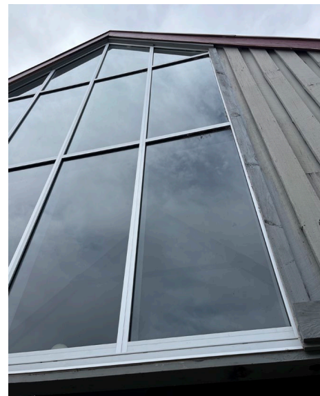
Figure 6 Recent replacement window above Avalanche cafe seating area, in appropriate matching style. As an example of the further window replacements to be made around the building.