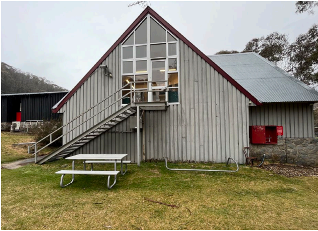
Figure 1 Facing towards staff accommodation, south end of building. Note cladding deterioration along base of the wall.  18.05.23