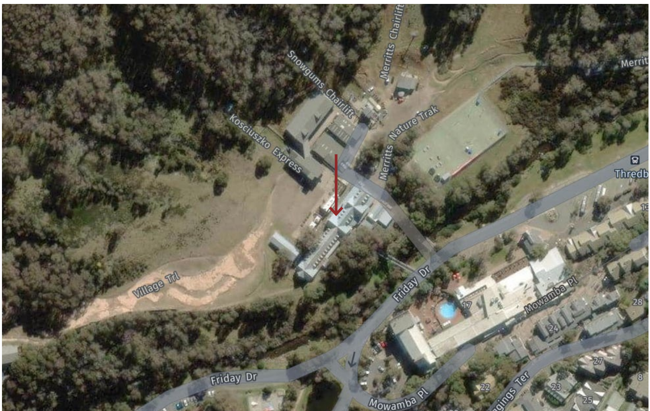
Figure 1 Overview of the area of the subject site, arrow indicates the Valley Terminal building.

The Valley Terminal is a long building running parallel with the contours across the site, from northeast to southwest. The long span of the gable roof is broken by both large gables with picture windows and timber cladding, as well as runs of small dormers windows. The vertical cladding and steep slope of the long gable form characterise the Valley Terminal's presentation.